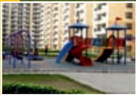
Actual Site Photo As on Mar'18